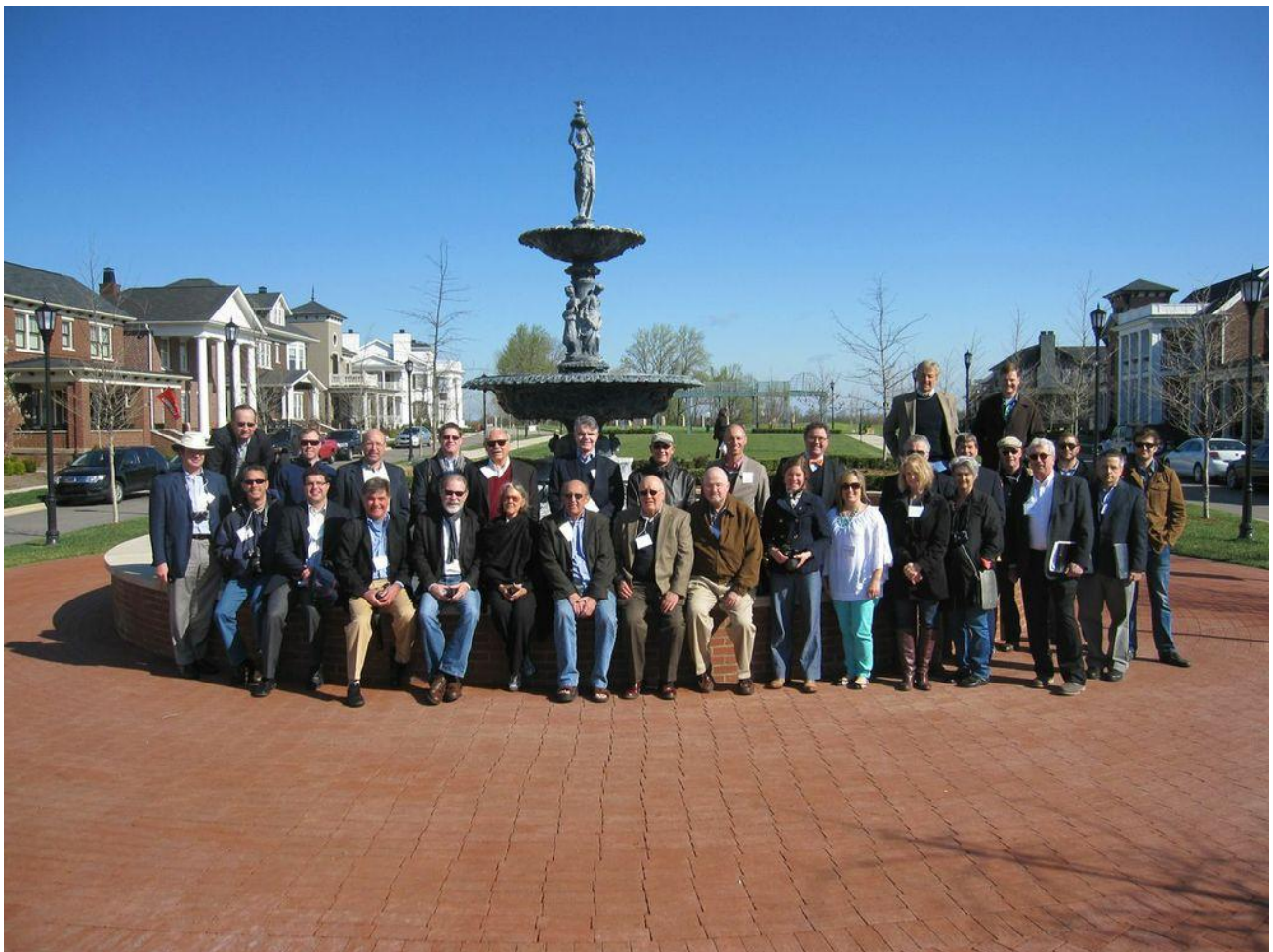
Photo of attendees at the 2013 Spring Roundtable in Louisville, Kentucky.